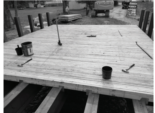
The Clifford Woods Bridge has been set, but rain has postponed its completion.

Winter Driving - Please use caution and keep a safe distance when you encounter our crew members out working to keep the roads clear of snow and ice. Remember that the road in front of the snow plow is usually in much worse condition than the roadway behind it. Plows will typically travel under 35 miles per hour and there is a temptation to pass them. Keeping a safe distance not only reduces the chance of accidents, it also helps prevent your vehicle from getting sprayed with anti-skid materials.